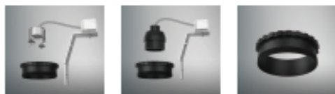
ACOT-82 MR16 Accessory kits